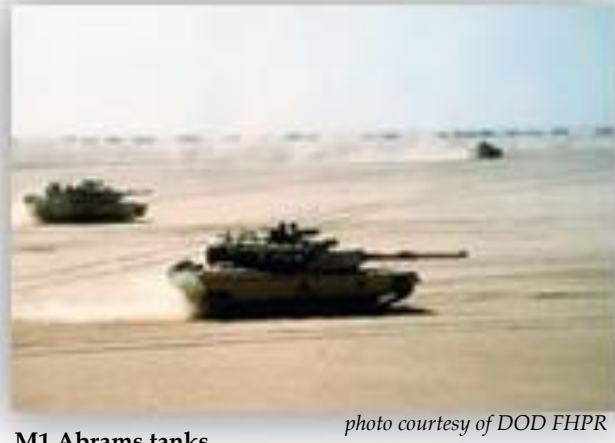
M1 Abrams tanks

its target, and its propensity to ignite on impact at temperatures exceeding 600 degrees centigrade. It is also used as defensive armor plate on the M1 Abrams tank.